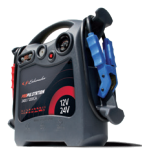
PPS 12/24V 2400/1200 CA